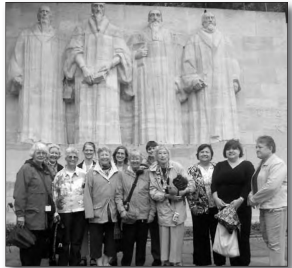
The group in front of the Reformation Wall in Geneva

While in Geneva, the women also shared in morning worship at the Ecumenical Center in Geneva with staff members of the World Council of Churches. Following worship and a tour of the facilities, the women were